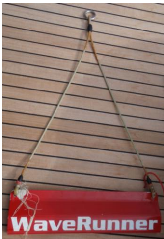
Sling and Spreader

Upon inspection, the steel lifting slings in use were found to have failed in way of the crimped eye connection to the spreader beam. The slings were found to be heavily corroded and this corrosion had not been identified by the onboard maintenance and inspection regime. Further, the history and origin of the lifting sling was not readily apparent. It was stated that they were supplied with the PWC, but the model and manufacturer of the sling could not be identified and no manufacturer's documentation of certification could be located.