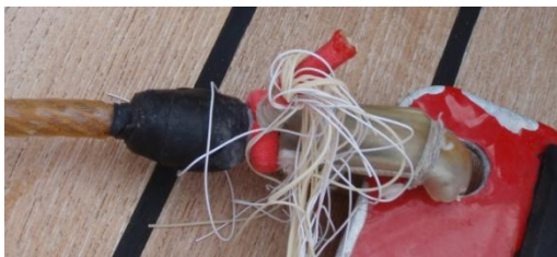
With “protective” tape