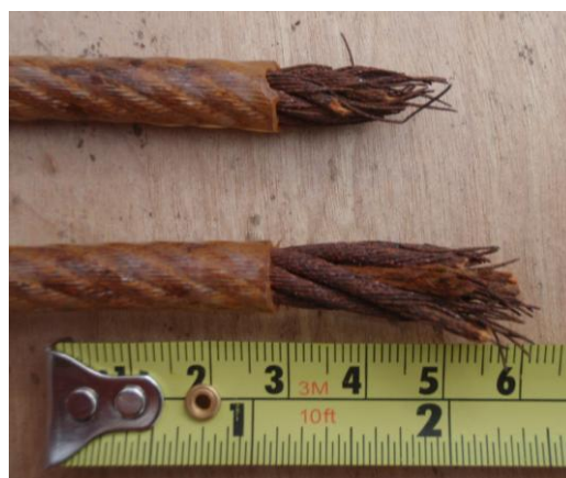
Corrosion of slings