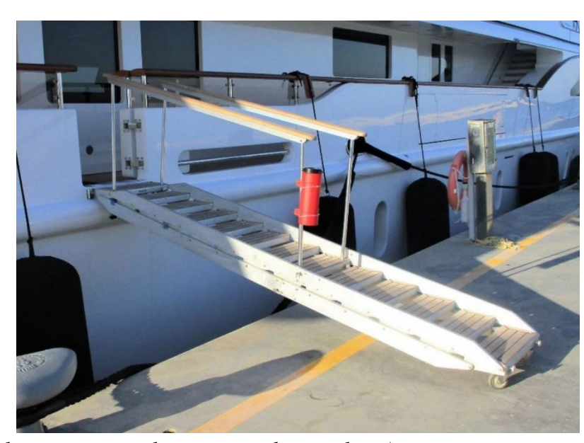
(Examples of yacht gangways without intermediate railings)

To prevent further accidents, the REG Yacht Code was amended in December 2020 to require gangways, passarelles and accommodation ladders to be provided with protection against falling overboard as follows –