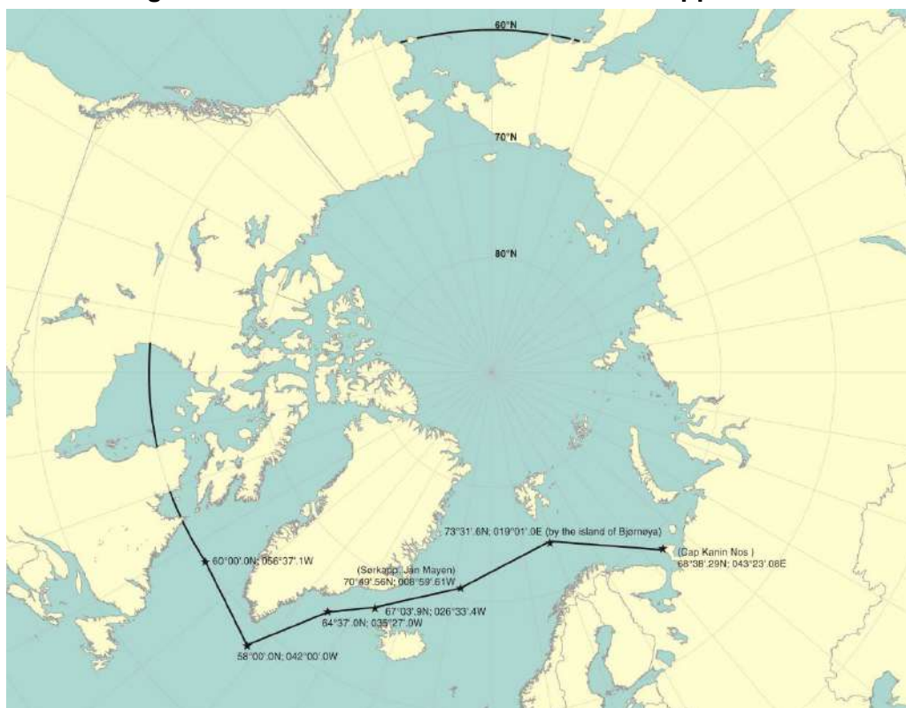
Figure 2 – Maximum extent of Arctic waters application